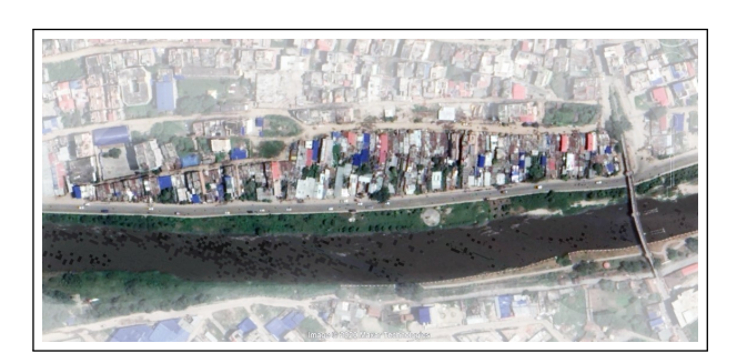
Figure 1: Sankhamul Informal Settlement

The Sankhamul squatter community, settled along the banks of Bagmati River is one of the oldest squatter communities developed in Kathmandu, with some of the families living there for 37 years. It is located 3.5 km away from the city core in a rapidly growing urban pocket. The neighborhood surrounding this settlement also shares the same name Sankhamul which at present is a mixed residential and commercial zone. Also there are monuments of historic importance facing this settlement on the opposite bank of the River.