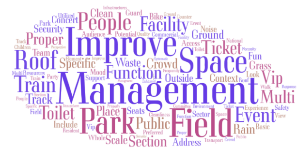
Figure 6: Word Cloud