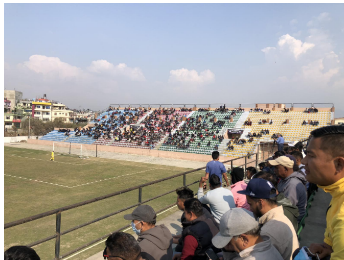
Figure 2: Chyasal Stadium

complex. It was originally built in 1994 for the National Games and has since evolved into a hub for various sporting events and activities. Such multi-purpose stadiums are instrumental in promoting sports, hosting diverse events, and catering to a wide range of sports enthusiasts and athletes [11]