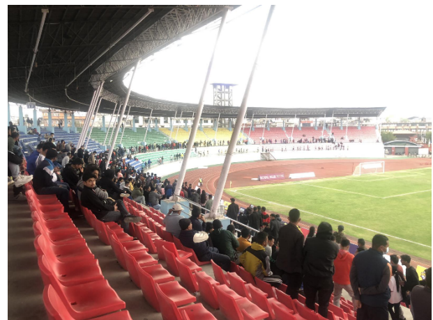
Figure 5: Dasarath Rangasala

The purpose of this research was to study the user perception of the stadiums. There is a need for more football-oriented stadiums and better sports facilities in Nepal. The interviewees emphasized the importance of having dedicated football fields and training facilities for players to improve their skills and potential. They believe that multi-functional