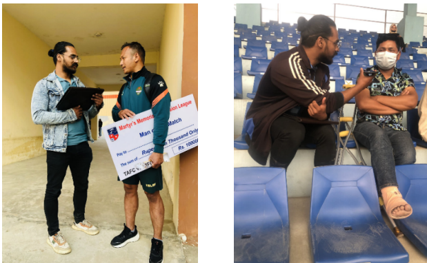
Figure 3: Interviewing

The survey took place at Chyasaal Stadium on March 9th, 2023, and Dasarath Rangasala on March 11th, 2023, with meticulous attention to authenticity. To ensure the data's credibility, the researcher personally attended the football matches in these stadiums, conducting open-ended, non-structured questionnaire surveys. Each interview had an average duration of approximately 12 minutes and was conducted while the respondents were engrossed in watching the football game. The data collected is firsthand and specifically focused on users' perceptions of the stadium's functionality and other relevant aspects. In total, 13 interviews were conducted, with 6 at Chyasaal Stadium and 6 at Dasarath Rangasala. Notably, the Vice President of the Lalitpur Federation was interviewed at his residence, while two interviewees provided insights in both stadiums, contributing to a comprehensive understanding of their perspectives.