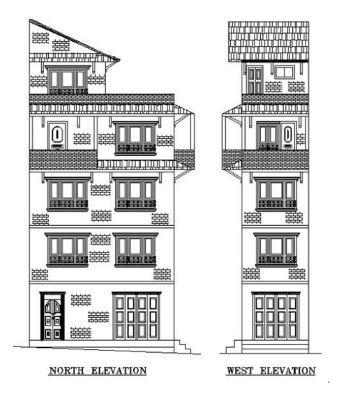
Figure 1: Elevation of approved building drawing