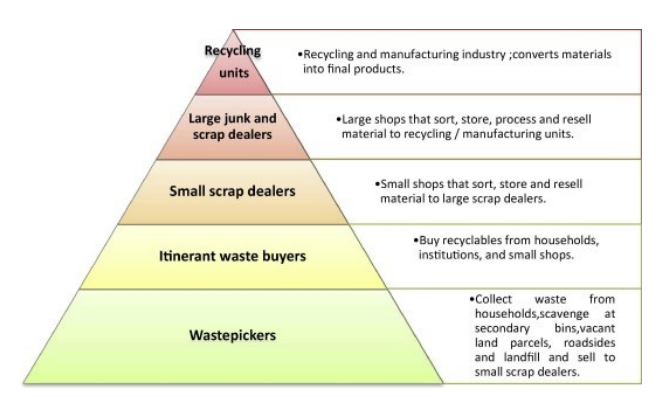
Figure 1: Informal Waste Collectors' Hierarchy[3]

of traders, the waste is finally processed by recycling units. The waste is sorted and refined at every level thus increasing the value of waste as it moves up the pyramid and these materials are added to the industrial value chain.