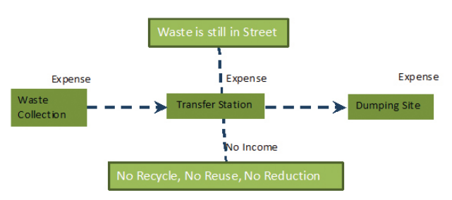
Figure 4: Current Status of Waste Management in Kathmandu[6]

There is large workforce involved and employed in waste collection, sorting, recycling and disposing. Informal waste managers are active in solid waste collection and recovery. The informal sector is a part of an economy that is not sponsored or monitored by any form of government, nor taxed, nor included into the gross domestic product, unlike the formal economy. The majority of the IWS<sup>3</sup> consists of self-employed waste reclaimers working individually, as groups or as families. Informal work provides crucial livelihood opportunities for the poor, alleviates poverty and functions as a buffer between employment and unemployment. Most people working as small farmers, street vendors/ hawkers/traders, micro-entrepreneurs, home-based workers, street reclaimers and artisans belong to the informal sector.