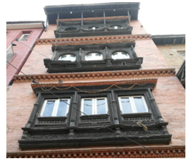
Figure 3: Change in façade of building

A number of buildings in study area were found to be replaced with modern buildings, some were found to have retained traditional looks over modern construction, some have been conserved in traditional manner and some were decaying. Qualitative observation was done to study the relation between