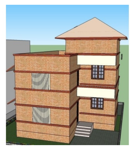
Figure 4: Proposed Building (Perspective View)