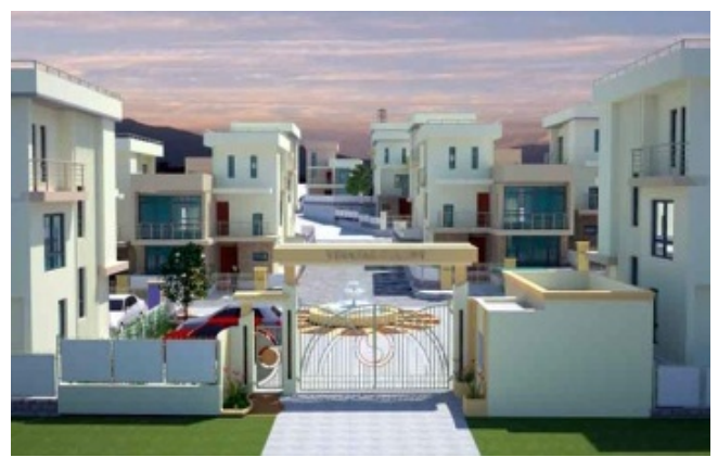
Figure 1: Vinayak colony (Schematic)

The housing unit considered as reference for analysis is a three bedroom unit with an approximate built up area of 2308.76 square feet. It is oriented towards east. The ground coverage is about 985.62 square feet which is about 49.1% of the site area. It has living, dining, kitchen and bathroom in the ground floor. The housing is constructed in reinforced concrete structure. The external and the internal partition walls are of locally available brick with cement mortar. Walls are cement plastered on both sides. The roof is constructed of reinforced concrete with cement plaster finishing and does not have any internal or external insulation. Windows are of single glazed. The roof is constructed of reinforced concrete with cement plaster finishing and does not have any internal or external insulation. Windows are of single glazed.