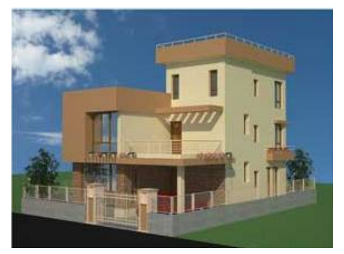
Figure 3: Existing Building (Perspective View)

The life span of solar panel is 30 year. This explains feasible in installation of solar panel but cost of maintenance of battery which is supposed to be in every 4 year will make it more costlier than shows in calculation regarding in payback period.