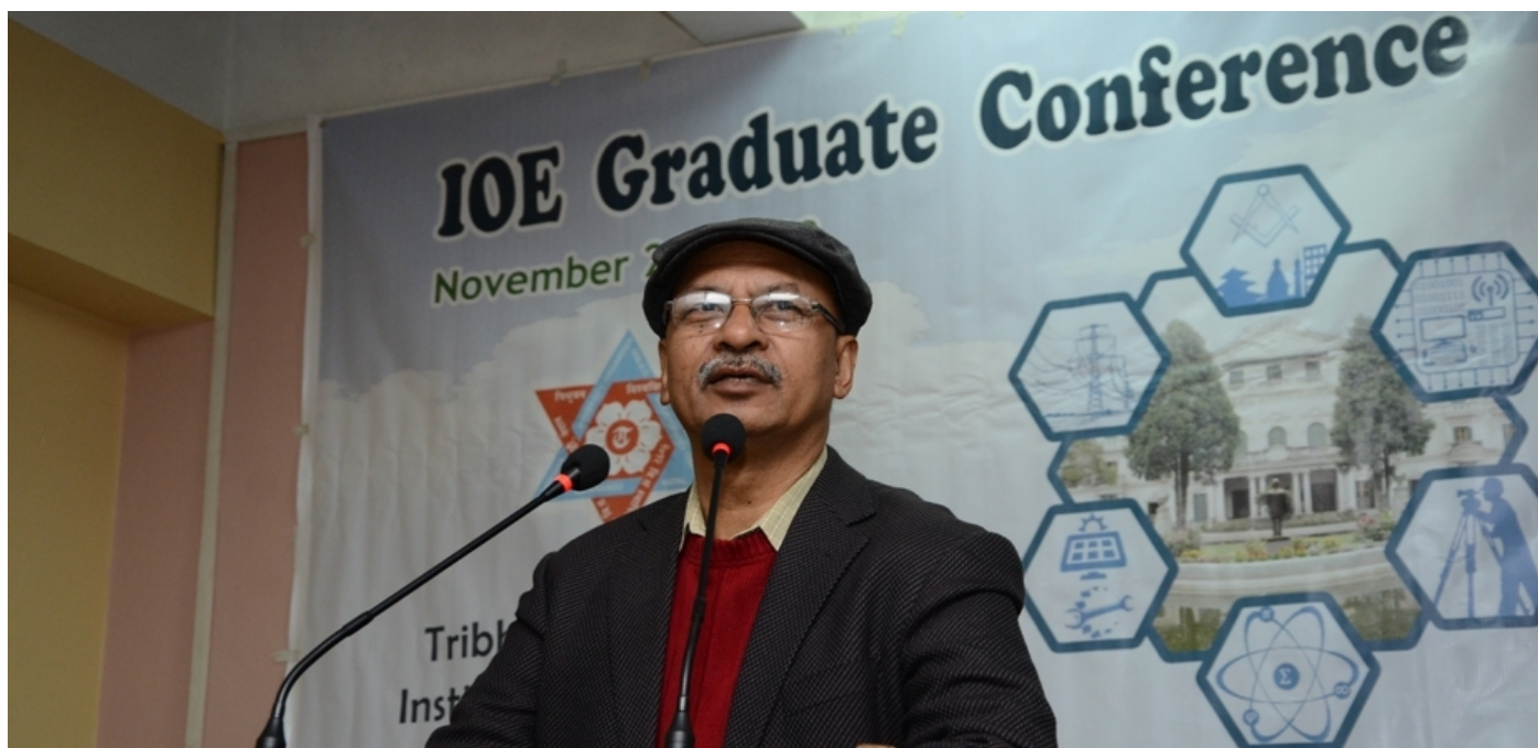
Figure 2: Placing a wide picture (Discouraged! as it always appears at the top of a page)

Figure 1 takes up 95% of the width of a column and Figure 2 takes the width of the entire width of the page.